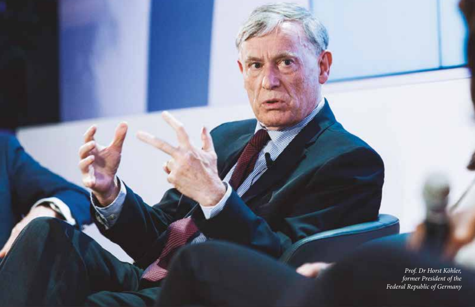
Prof. Dr Horst Köhler, former President of the Federal Republic of Germany